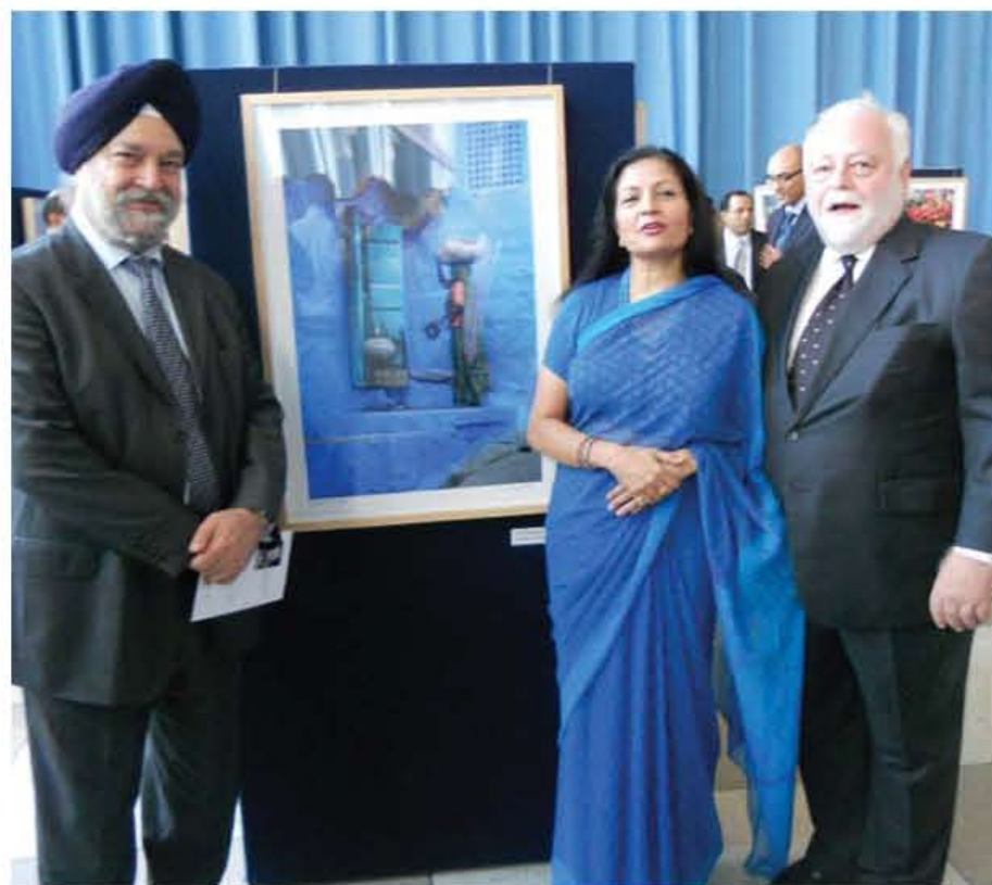
Some of the photos at the exhibition